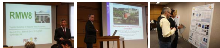
Le Méridien Cambridge-MIT

The 8th Workshop on Reactive Metal Processing March 8 – 9, 2013 @MIT, Cambridge, MA