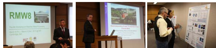
Le Méridien Cambridge-MIT

The 8th Workshop on Reactive Metal Processing March 8 – 9, 2013 @MIT, Cambridge, MA