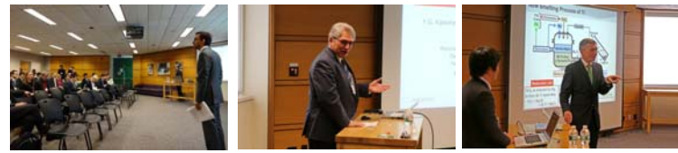
MIT Museum @MIT

The 10th Workshop on Reactive Metal Processing March 20 – 21, 2015 @MIT, Cambridge, MA