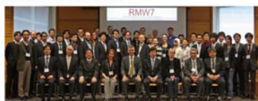
RMW7 in 2012 at MIT