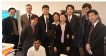
RMW1 in 2006 at MIT