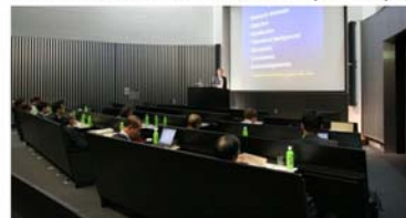
RMW2 in 2006 at IIS, the University of Tokyo