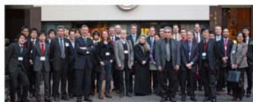
RMW5 in 2010 in Seattle