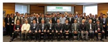
RMW8 in 2013 at MIT